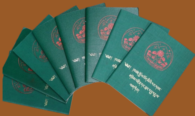
Green Book (of all the members)