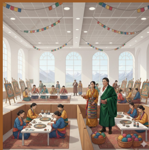
Workshops & Trainings

Art and cultural activities beyond the above categories are also eligible