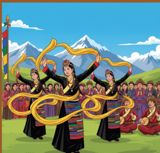
Traditional Music & Dance Programs