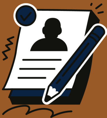
Support Letter from Settlement Office