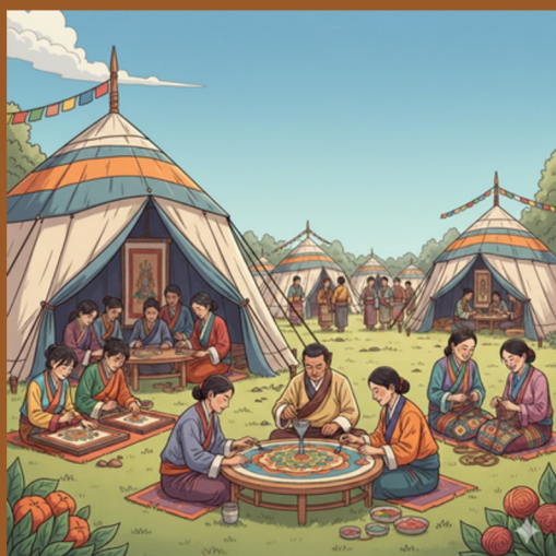
Community Cultural Events