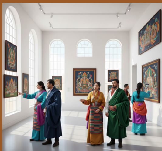
Traditional Art Exhibitions